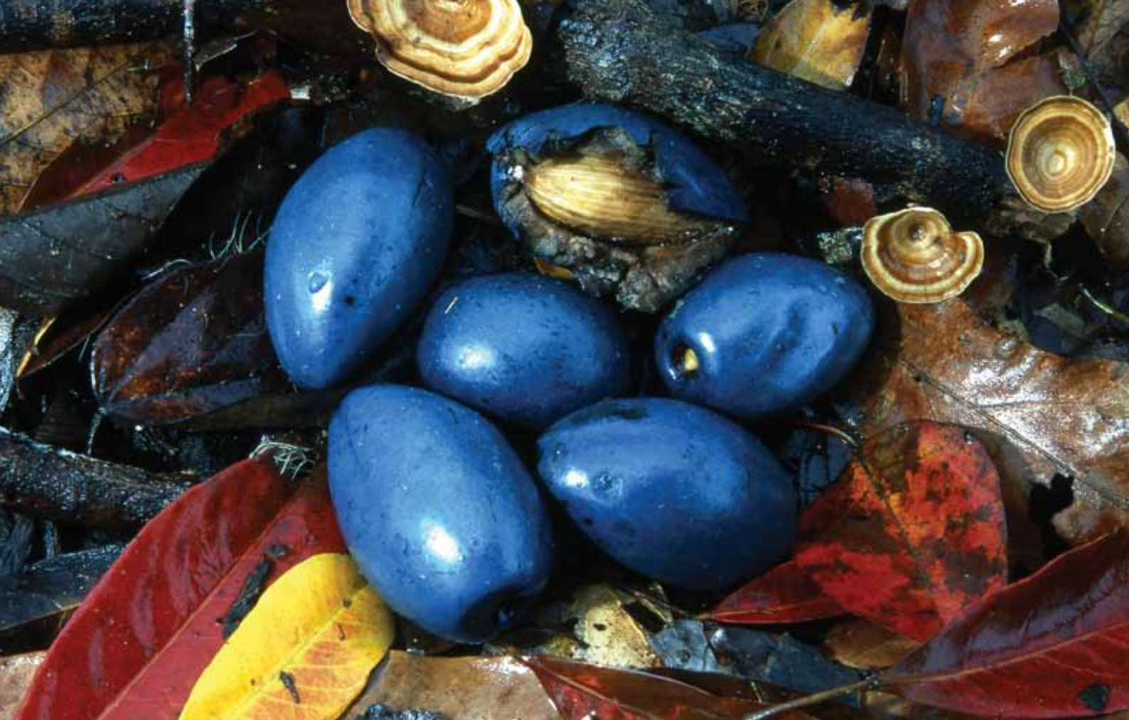
Cassowary plum ( Cerbera floribunda K. Schum.), recognised by Rainforest Aboriginal people as a vital food source for cassowary

little modified by industrialisation, once considered “wilderness”, are now recognised as Indigenous cultural landscapes (Hill & Figgis, 1999). The “Vegetation Assets, States and Transitions” framework classifies vegetation by degree of human modification as a series of states, from intact native vegetation through to total removal (Lesslie et al., 2010). Those parts of Australia considered to contain residual native vegetation are shown in Figure 1. Apart from Australia’s southern territories (Macquarie and Heard Islands) that appear to have been unoccupied prior to the 19 th century, all of Australia has been shaped, and continues to be in many areas, by Indigenous occupation and management practices. The areas shown as residual native vegetation on Figure 1 are more properly considered residual biocultural diversity.